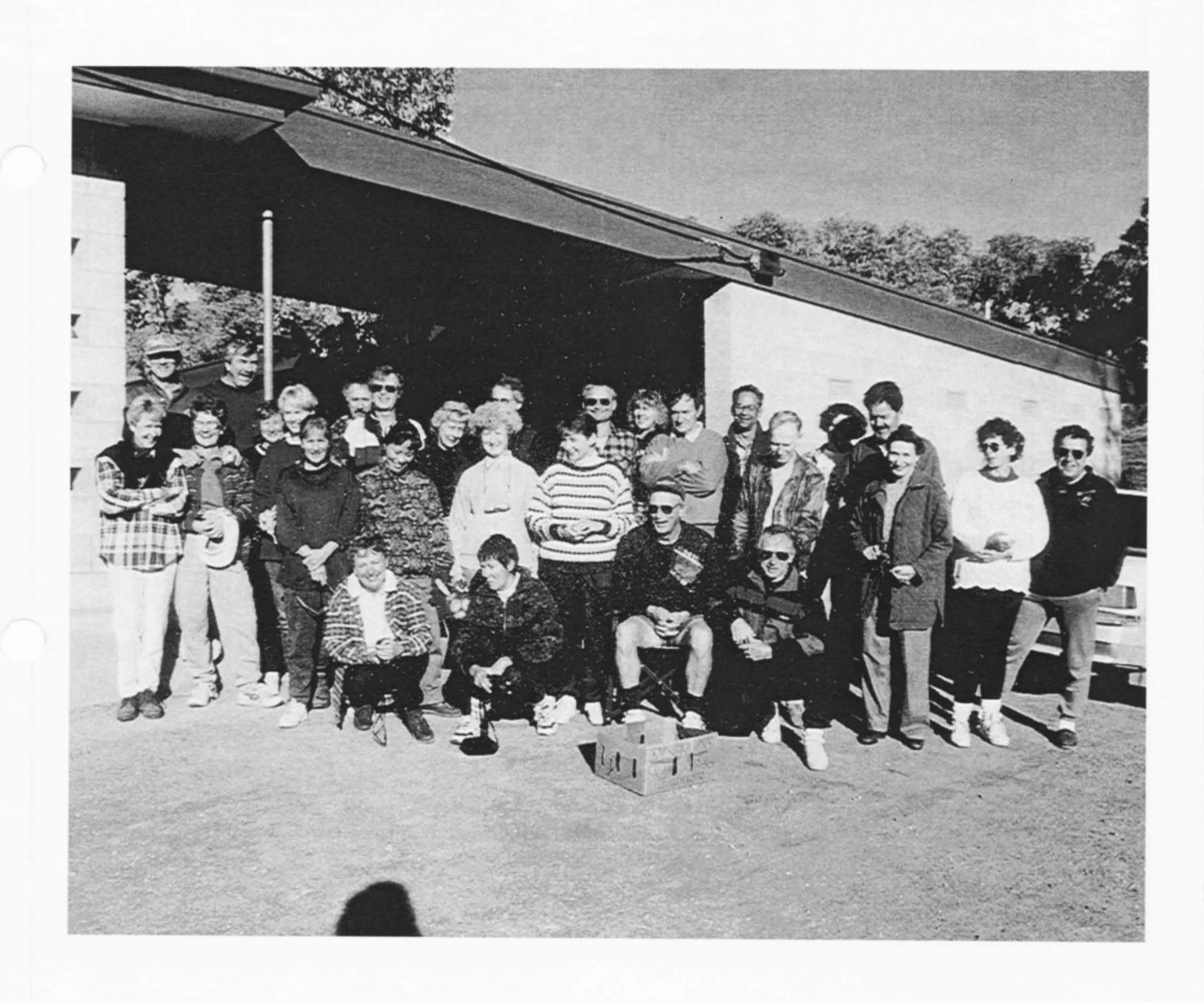
"THE GROUP" - FLINDERS WEEKEND