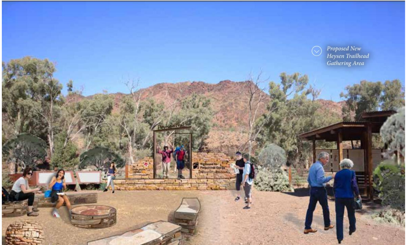
Simulated view of the Northern Trailhead looking south.

Note: While the operation of the Friends remains financially sound, these projects, due for completion in 2024, will impact on our budget (23-24) as we draw from our accumulated reserves to fund them.