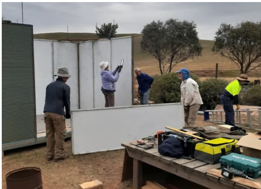
Assembling the new shelter at Wandillah

vegetation. They also play an important role helping to train newer volunteers and sustaining a positive relationship with the many private landholders that support the Trail.